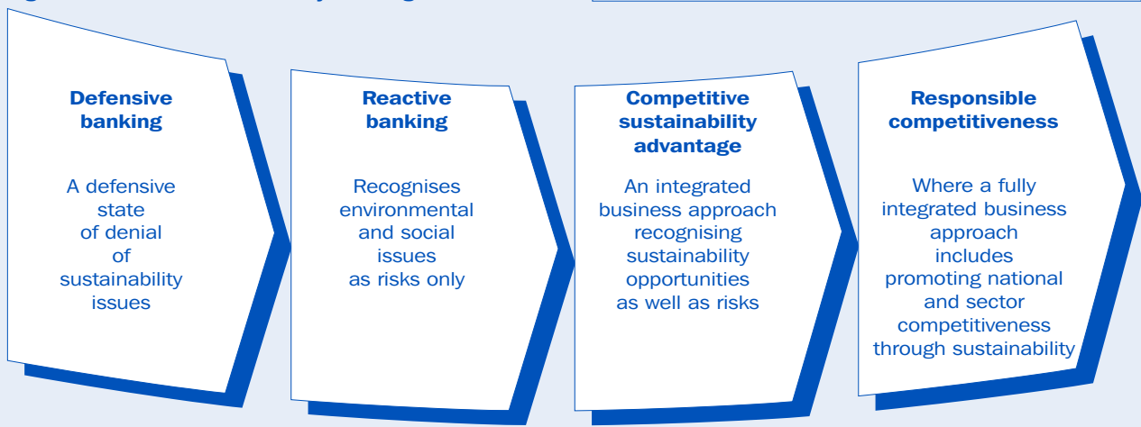
Figure 1: Towards Sustainability Banking