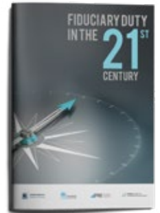
Fiduciary duty in the 21 st century

Despite growing awareness, an implementation gap remained with capital markets often not accounting for the sustainability-related risks and opportunities associated with ESG issues such as climate change. In 2015, Fiduciary Duty in the 21 st Century clarified that ESG integration is not just permissible but required. Since publication, financial regulators in Brazil, France, EU, Ontario, South Africa and UK have clarified (or have committed to clarify) ESG requirements in legislation.